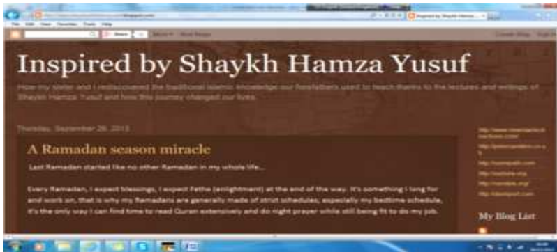
Figure 3 One blogger dedicating her blog to Hamza Yusuf

Like the televangelist Amr Khaled, Yusuf makes use of a variety of digital media tools for a wider mediation of his discourses. One point that is worth noting here is how Hamza Yusuf’s fans and followers make use of online spaces to popularize his discourses. For instance, figure 3 below shows one blogger who has dedicated her blogspot to Hamza Yusuf; 46 the introduction to the blog reads: ‘How my sister and I rediscovered the traditional Islamic knowledge our forefathers used to teach thanks to the lectures and writings of Shaykh Hamza Yusuf and how this journey changed our lives’.